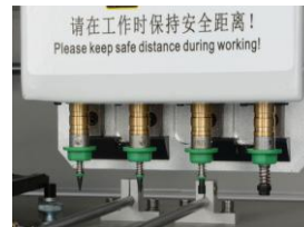
4 Heads Juki Nozzle