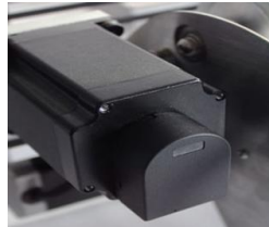
Axis closed-loop control