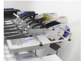
Yamaha pneumatic feeder