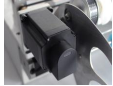
Axis closed-loop control