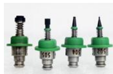
High quality Juki Nozzles