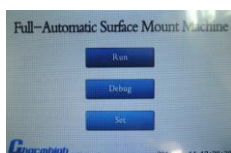
Full Touch screen operation