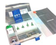
Complete tool box