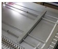
Flexible PCB clamp area