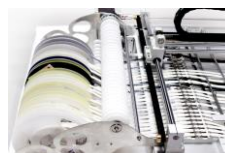
1-29pcs different width feeders